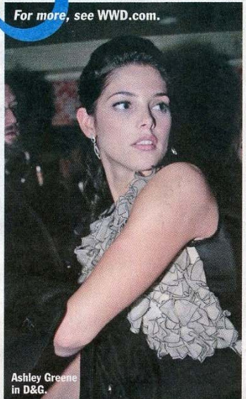
Ashley Greene in D&G.