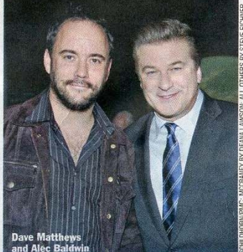
Dave Matthews and Alec Baldwin