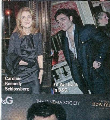
Caroline Kennedy Schlossberg