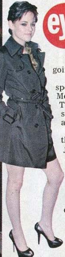
▲ Kristen Stewart in a Burberry trench and Valentino dress.